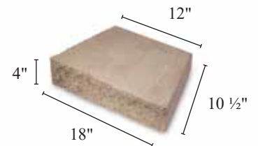
4" UNIVERSAL CAP