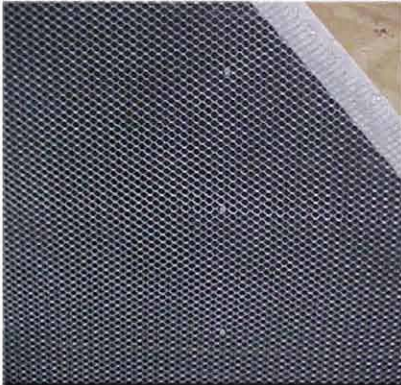
1. Prepare the Surface