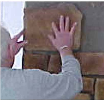
4. Applying the stone