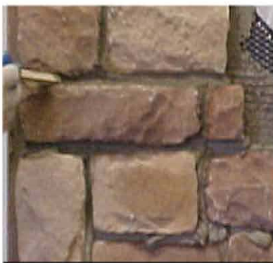
7. Striking the joints