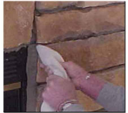
6. Grouting the joints