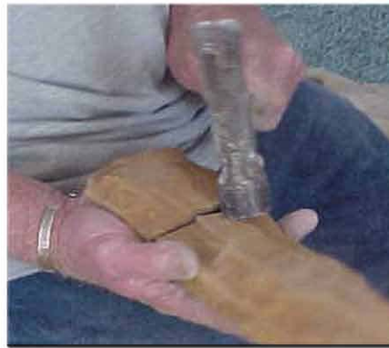
5. Trimming the stone