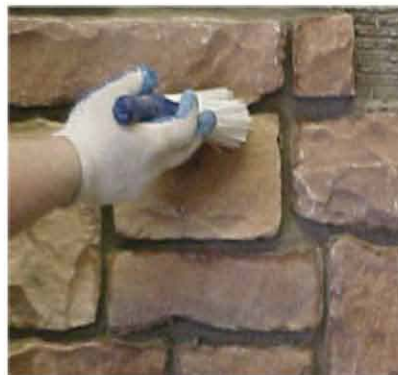
8. Brushing joints