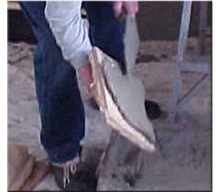
3. Mudding the stone